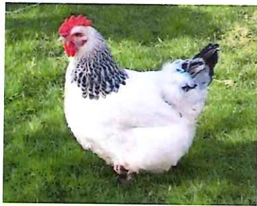
5 HENS ALLOWED