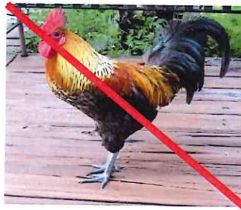
ROOSTERS NOT ALLOWED